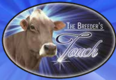
KRUSES LJ DAIRYSTAR SARA E90/92MS DAM OF LOT 47