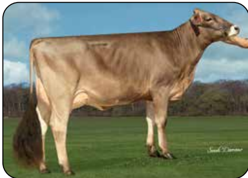
HILLTOP ACRES D TEAGEN ETV SELLS AS LOT 62

REG: 840003256390076 DOB: 10/17/2022 TATTOO: 2628 Genetic Conditions: PT DT MT WT BH2T BH14T 02/03 +83 +81 +81 +80 +81 V85 (01/25) PPR: +90 64%R PTAT: +0.6 UDC +0.92 76%R PTA: +415m +28f +24p +315NM$ 92%$ (GEN) +2.6 PL +0.5 DPR -0.7 CCR 0.0 HCR DEV: +3686m +170f +118p (04/25) 02/02 108d 3X 8980 4.6 412 3.3 299 RIP Last test 92# 4.9%f 3.6%p