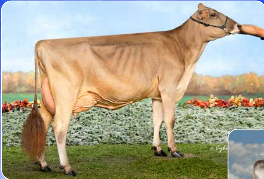
BROOK-LODGE W FIREBALL ET 2E93/93MS DAM OF LOT 52