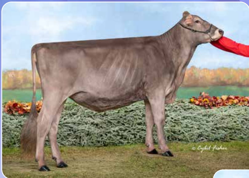
JENLAR RASTA WESTLYNN ETV ALL-AMERICAN DAM OF LOT 20 MATERNAL SISTER TO LOT 19