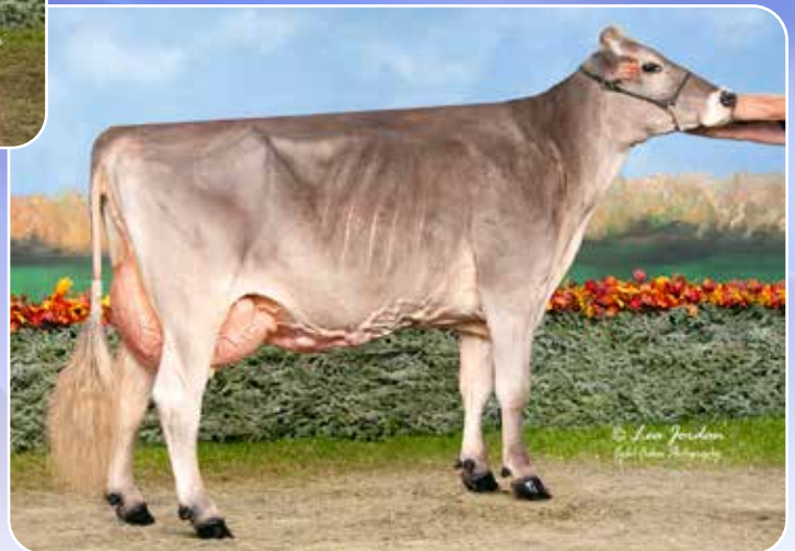
SHILOH DURANGO TORI 2E93/94MS HM ALL-AMERICAN GRANDDAM OF LOT 48