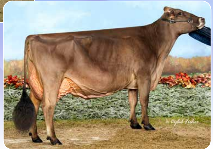
CIE DOUBLE W EM FAVOR 2E95 ALL-AMERICAN GRANDDAM OF LOT 57