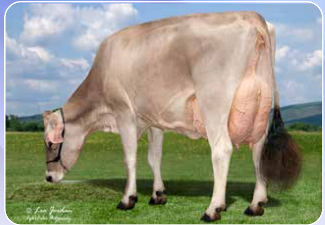
HILLTOP ACRES DDEVIL KASSIDY ET 2E91 DAM OF LOT 11, GRANDDAM OF LOT 9, 3RD DAM OF LOT 10