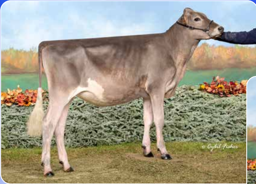
ROSEDALE A HUGE STAR ET OCS HM NATIONAL BELL RINGER WINTER CALF 2024 SELLING AS LOT 32