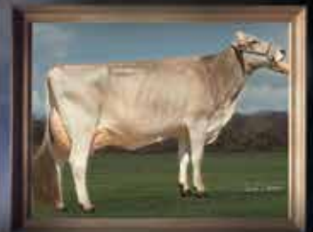
Hilltop Acres Kingsley Tammie 'E 92 E 94 MS' Dam of TOP NOTCH