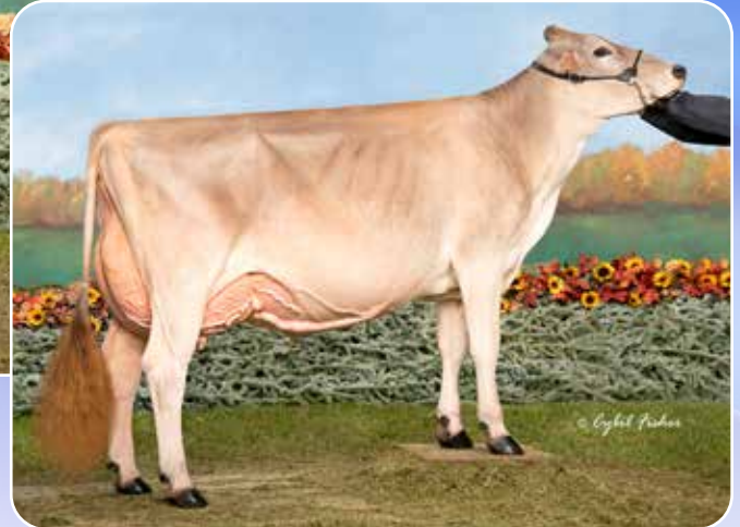
R N R DURHAM ALLY 2E91 ALL-AMERICAN DAM OF LOT 32