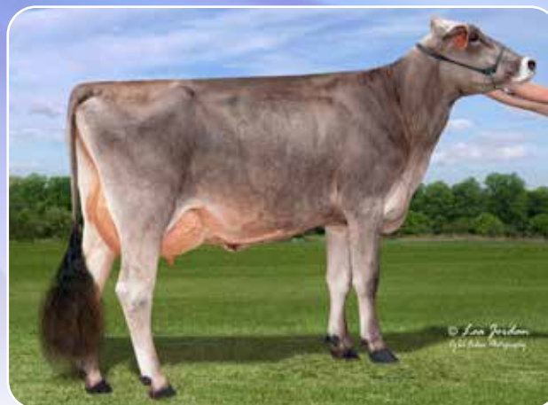
KRUSES KRUNCH CORKY E90/91MS SELLS AS LOT 46