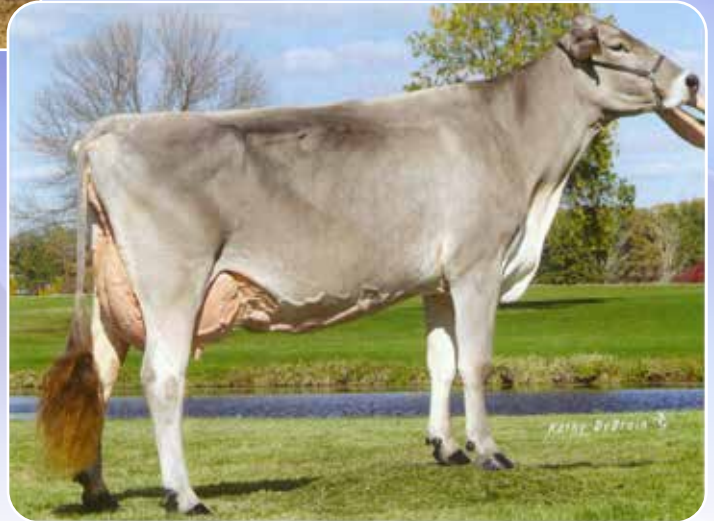
SUNNYISLE COLBY TWILITE ET 2E93 ALL-AMERICAN & WDE GRAND CHAMPION 3RD DAM OF LOT 81