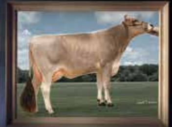
HF LC Chasing Dreams-ET 'V 88 88 MS' Dam of DESIGN