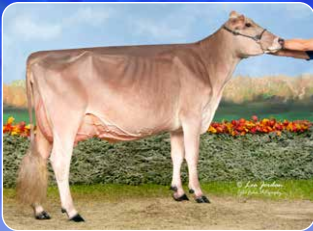
KRUSES ACC C JENESIS ETV VG89/90MS NOM. ALL-AMERICAN MAT. SISTER TO LOTS 42 & 43 MAT. SISTER TO DAM OF 44 & 45