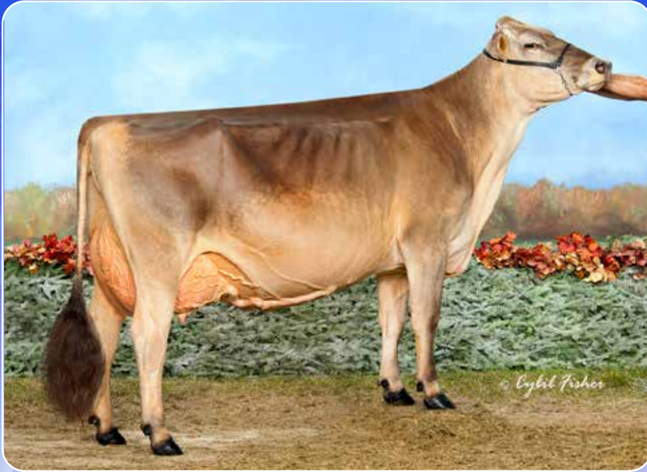
CUTTING EDGE T DELILAH 2E95/95MS 2X SUPREME CHAMPION DAM OF LOT 21-23