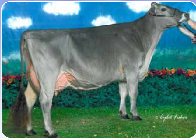
VALLIGROVE JETWAY NORA '2E93' ALL-AMERICAN FOUNDATION OF LOTS 53-56