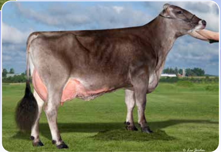
PERRY BROOK BUSH INDIAN VG88/90MS GRANDDAM OF LOT 51