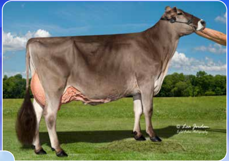
A JOY RICH SNOWBERRY 2E90 DAM OF LOT 49