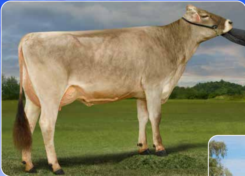
TOP ACRES DAREDEVIL WISP ET SELLS AS LOT 38