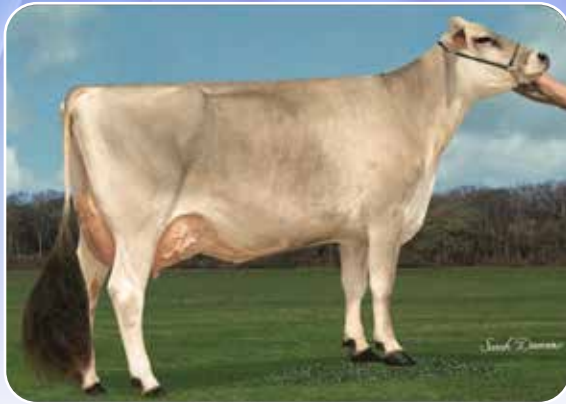
JUST SO D FARAWAY ET E92/92MS DAM OF LOT 28