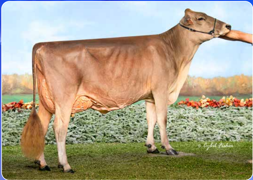
JENLAR CARTER WALTZ EX91/92MS ALL-AMERICAN DAM OF LOT 19 & GRANDDAM OF LOT 20