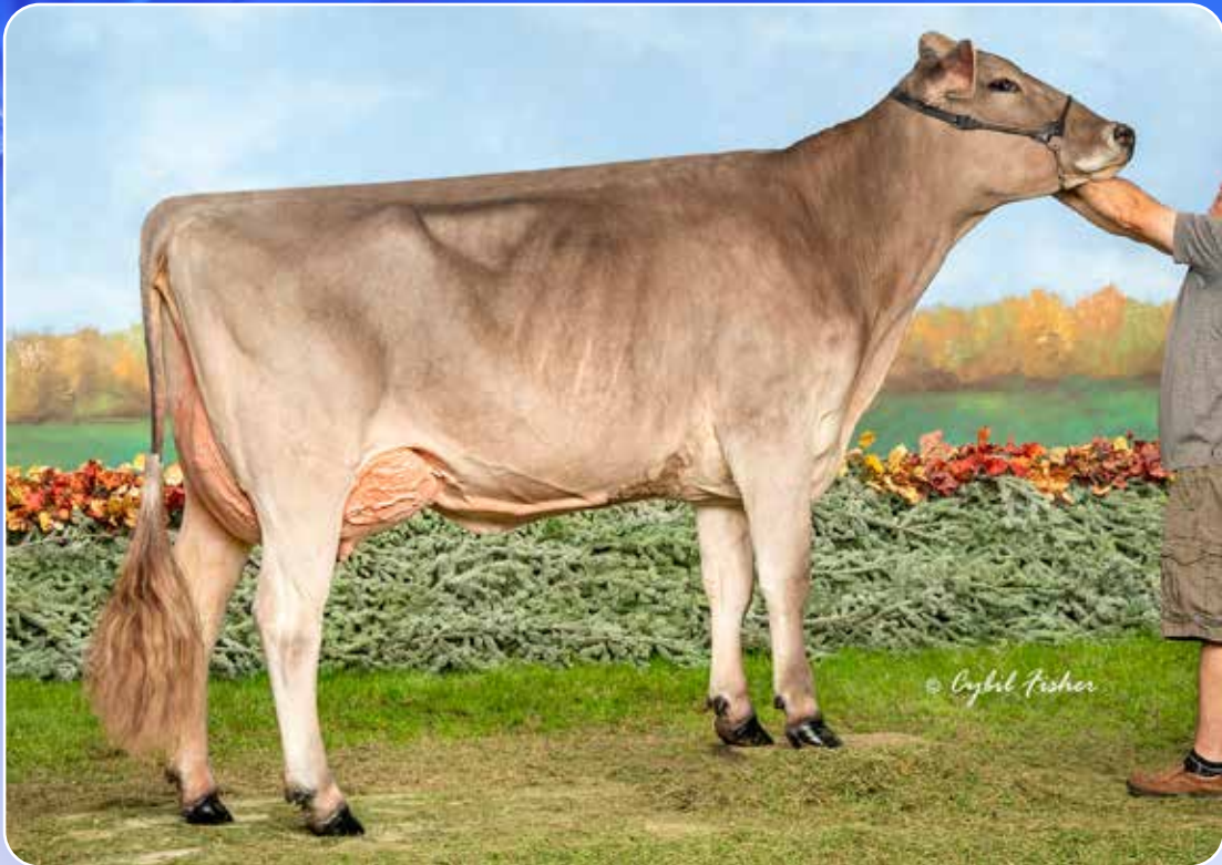
IROQUOIS ACRES CLIFF DREAMER E91/91MS SELLS AS LOT 67