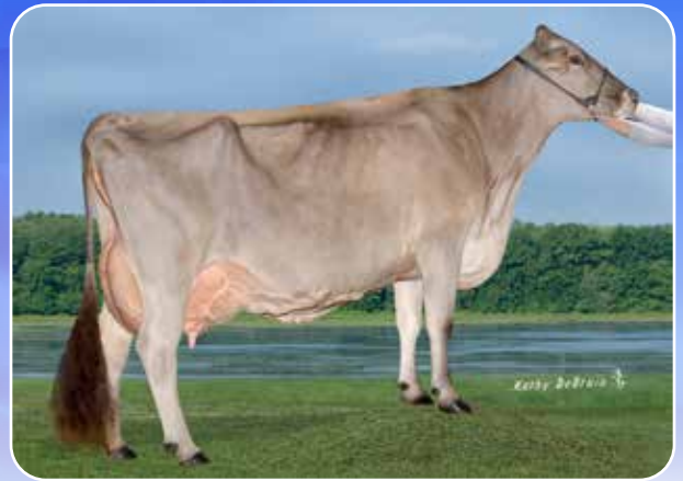
POWER LINE RICH WHATEVER ET 3E93/93MS GRANDDAM OF LOTS 77 & 78