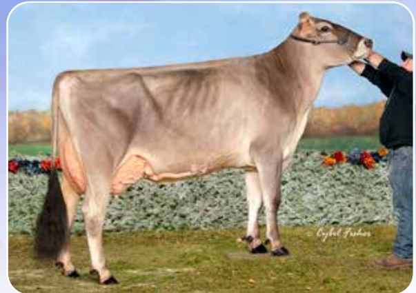
VB HP CV MOTOWN SECRET E91/92MS 3RD DAM OF LOT 29