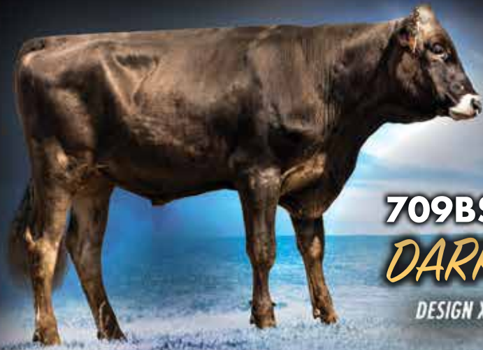
709BS3 HILLTOP ACRES DARK HORSE DESIGN X HUGE X BOSEPHUS