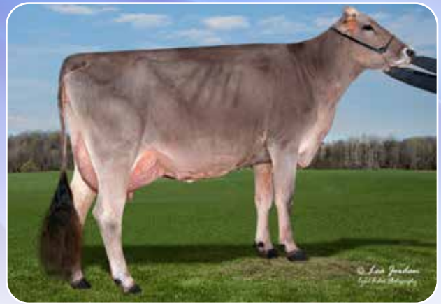
KRUSES MARTINI SPICEY EX90/90MS 2/04 363D 2X 20035 4.6 914 3.6 718 MATERNAL SISTER TO DAM OF LOT 47