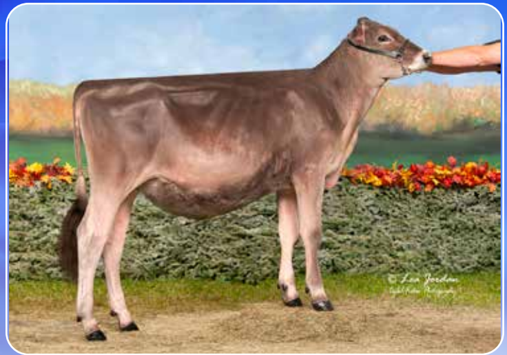
TOMPSVIEW FAME NUS-ET NOM ALL-AMERICAN WINTER CALF 2024 NATIONAL BELL RINGER WINTER CALF 2024 MATERNAL SISTER TO LOT 56