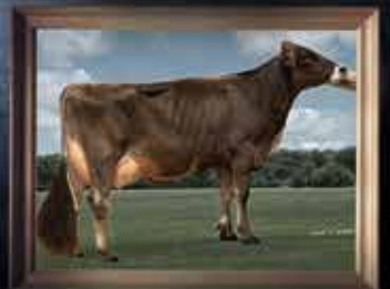
Hilltop Acres DB Tabby ETV '2E 91' 2nd Dam of TOP NOTCH