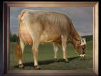
Hilltop Acres H Damara 'V 87 V 88 MS' Dam of DARK HORSE