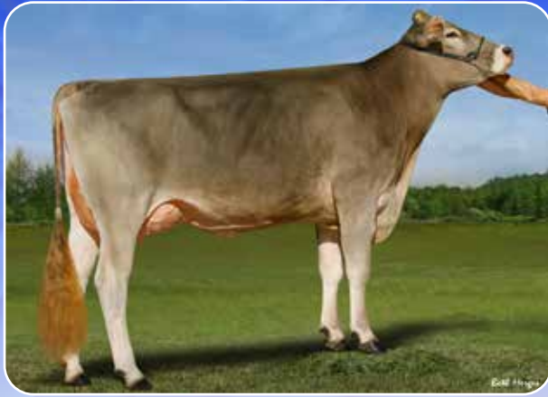
JUST SO T WONDER ET VG85 DAM OF LOTS 77 & 78