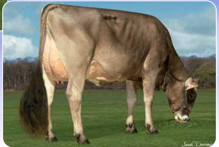
HILLTOP ACRES D TEAGEN ETV +83/85MS FULL SISTER TO HILLTOP ACRES TRICKSTER SELLS AS LOT 62