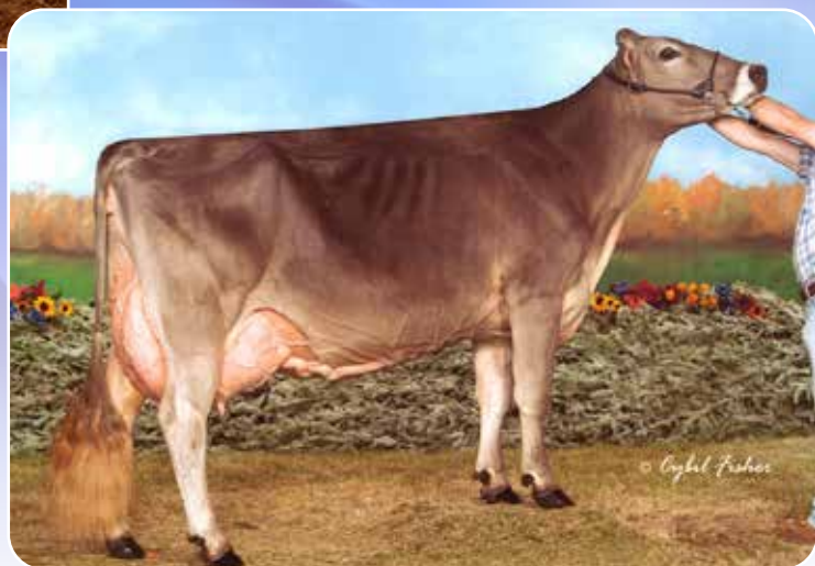
CUTTING EDGE PS STORM ET 2E92 ALL-AMERICAN 3RD DAM OF LOT 83