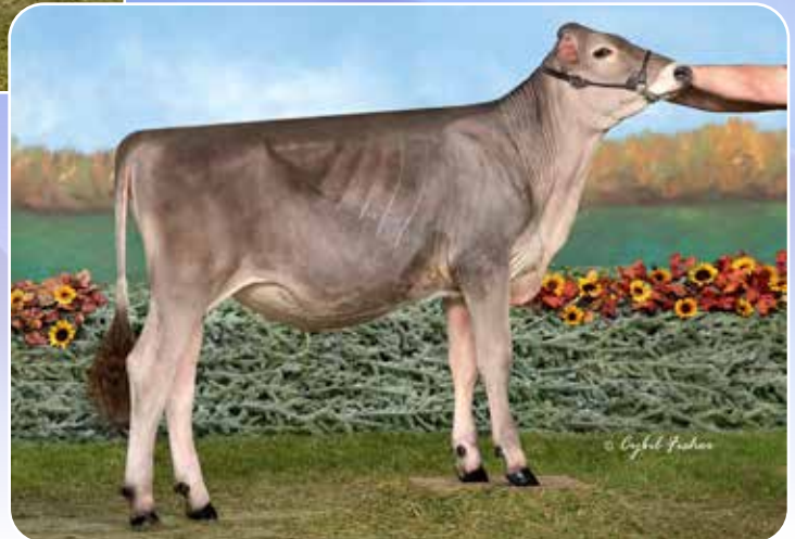
BROWN HEAVEN ANT SISTER DALLY ET UNANIMOUS ALL-AMERICAN WINTER CALF 2022 MATERNAL SISTER OF LOT 69