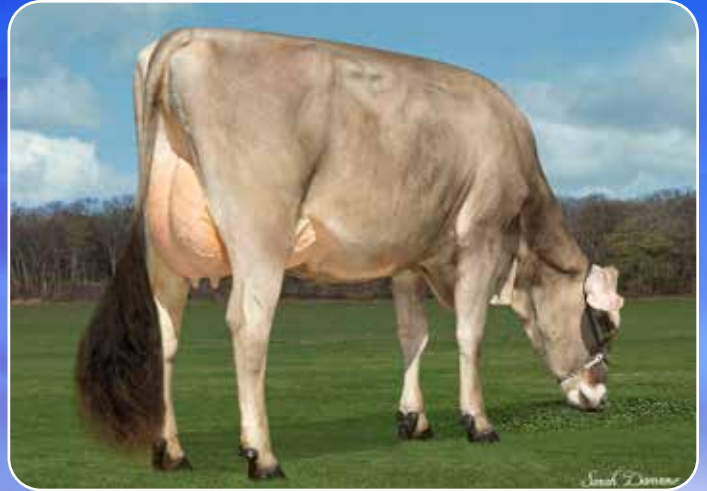
HILLTOP ACRES J TIKTOK ET V85/85MS DAM OF LOT 64