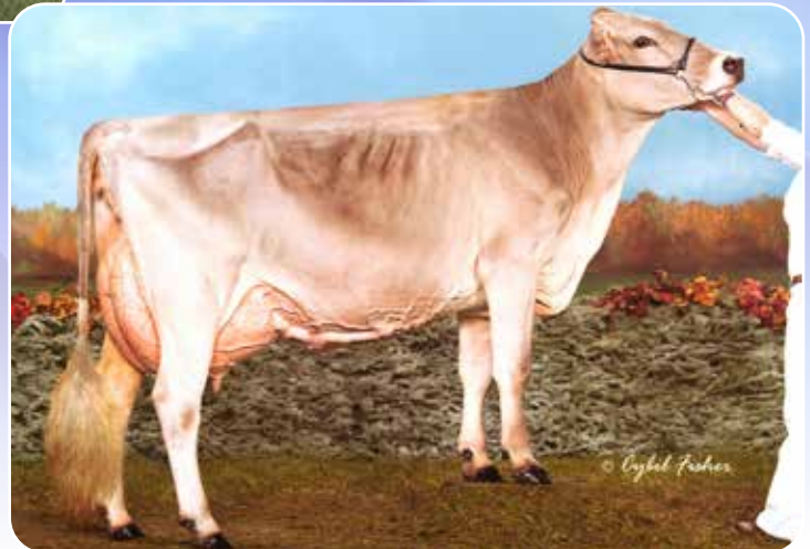
NIEMRANS BRAVO VINRAE E90/91MS ALL-AMERICAN NOMINATED GRANDDAM OF LOT 66