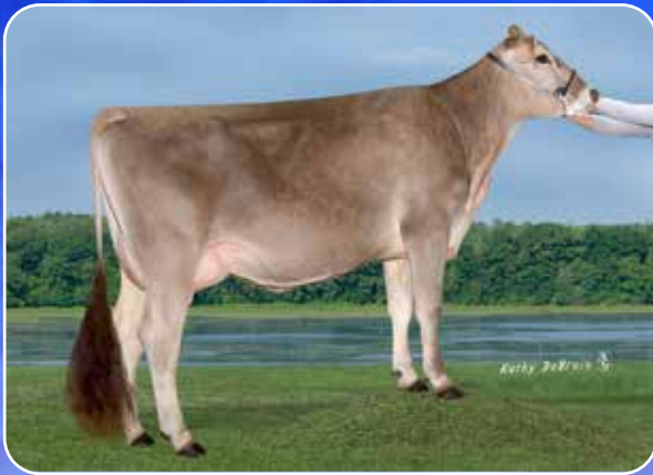
JUST SO W FANCY ETV VG85 AA NOM DAM OF LOT 27