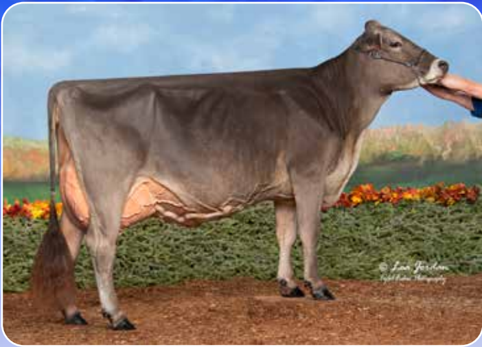
WF BIVER NORTHERNLIGHTS ET 2E94 3X ALL-AMERICAN NOMINATED DAM OF LOTS 53 & 54