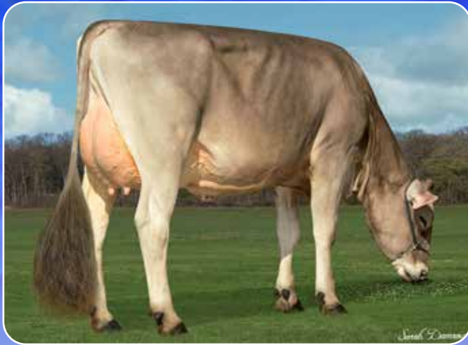
HILLTOP ACRES D TANIKA +84/+84MS SELLS AS LOT 63