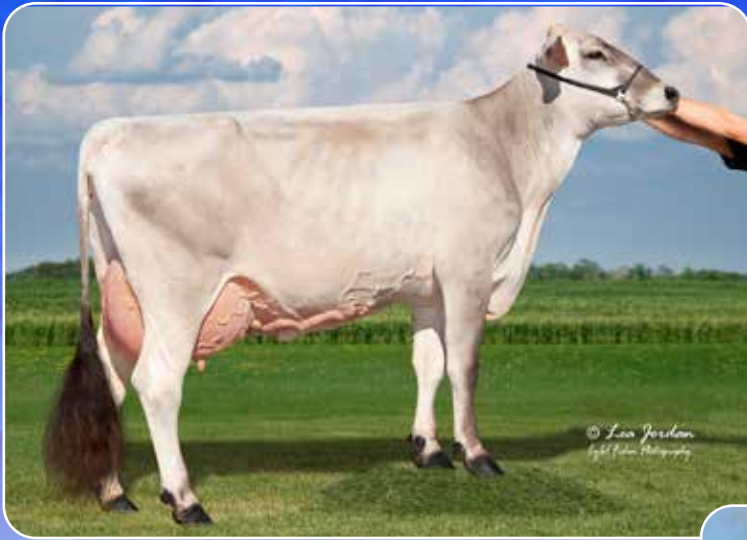
PERRY BROOK LUCKY INDIA VG87/88MS DAM OF LOT 51