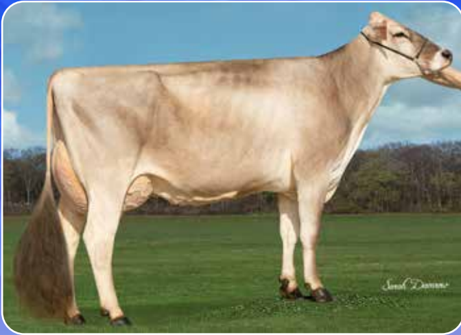
HILLTOP ACRES D KAYDEN ETV E91/91MS SELLS AS LOT 9 & DAM OF LOT 10