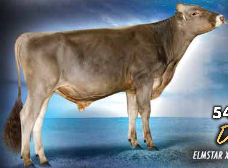
54BS611 HF DESIGN ELMSTAR X LUCKY CARL X ARCHER