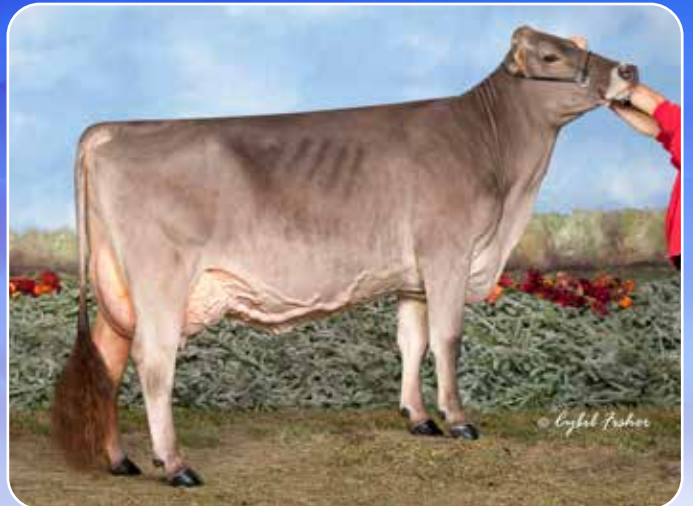
JO-DEE DENMARK NOOKIE ET 2E92 HM ALL-AMERICAN GRANDDAM OF LOTS 53 - 55