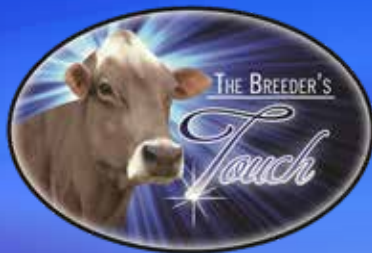
CUTTING EDGE STRATUS SUE 3E94 ALL-AMERICAN GRANDDAM OF LOT 83