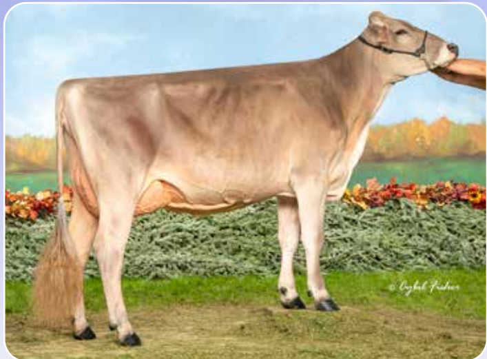
KRUSES CARTER JIVE ET VG86 3X NOM. ALL-AMERICAN MAT. SISTER TO LOTS 42 & 43