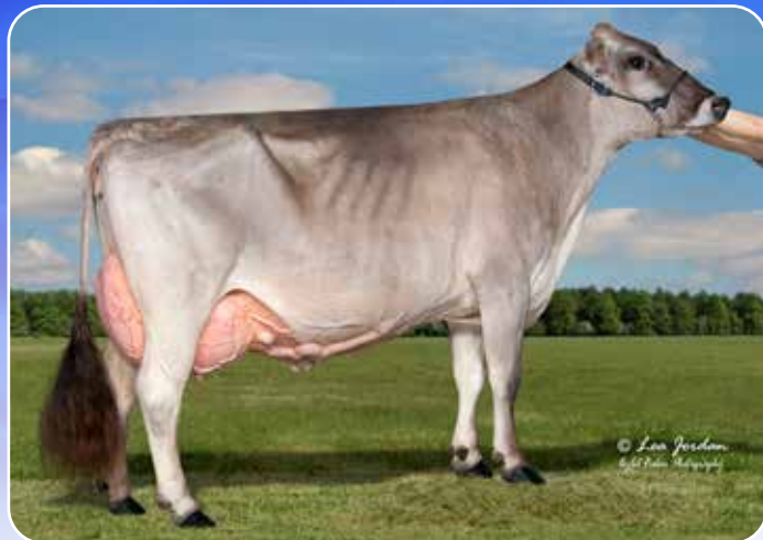
RED BRAE SPA RICHARD NICOLE E91/90MS GRANDDAM OF LOT 67 & 68