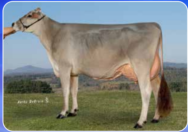
CUTTING EDGE WF FARGO 2E93 MAT. SISTER TO LOTS 24 & 26 | NOM. AA GR'DAM OF LOTS 27-28