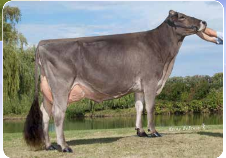
TOP ACRES SUPREME WISP ET 3E95/95MS RES. ALL-AMERICAN DAM OF LOT 38