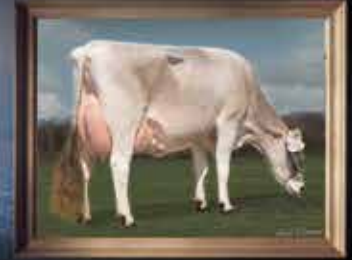
Hilltop Acres Bose Dixiland ET '3E 93 E 93 MS' 2nd Dam of DARK HORSE