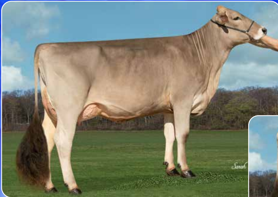
HILLTOP ACRES TM WENDY Full Sister to Apex TO World Class ETV #1 PTAT & #1 UDC Bull in the Breed! SELLS AS LOT 33