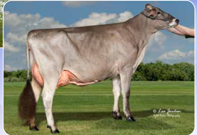
BLESSING GARBRO FAMOUS FIRE VG88 NOM ALL-AMERICAN MAT. SISTER TO LOT 52