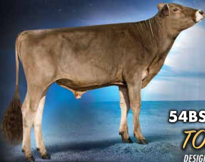
54BS628 HILLTOP ACRES TOP NOTCH DESIGN X KINGSLEY X DOBOY