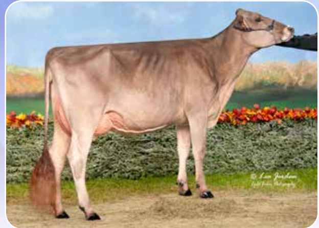
EDGE VIEW F FARAWAY VG87/89MS DAM OF LOT 26