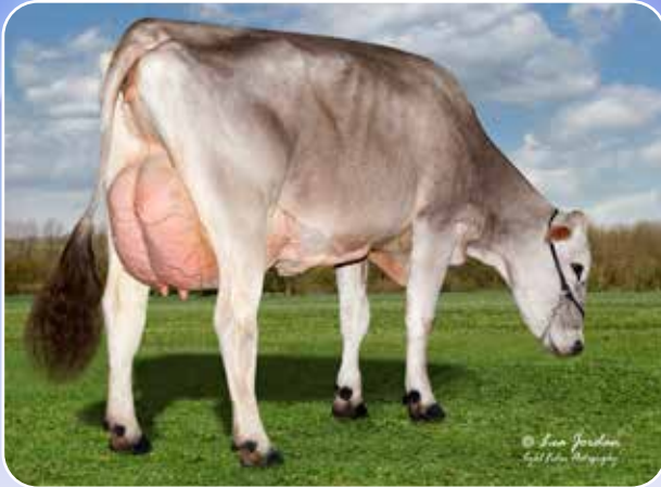
HILLTOP ACRES S KADENCE ET 2E92 DAM OF LOT 9 & GRANDDAM OF LOT 10, MAT SISTER LOT 10