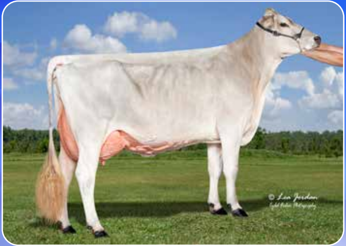
WF CARTER NINA ET 2E91 GRAND CHAMPION DAM OF LOT 55