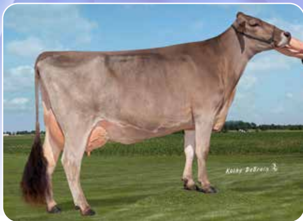
JO-DEE WONDERMENT NUCLEAR ET 2E92 2X NOM ALL-AMERICAN GRANDDAM OF LOT 56