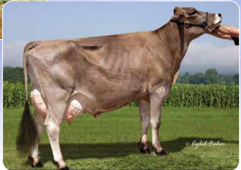
JENLAR AGENDA TRILLIUM 4E94 GRANDDAM OF LOT 71