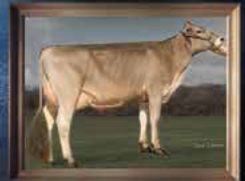
Hilltop Acres D Tanika Daughter of DESIGN