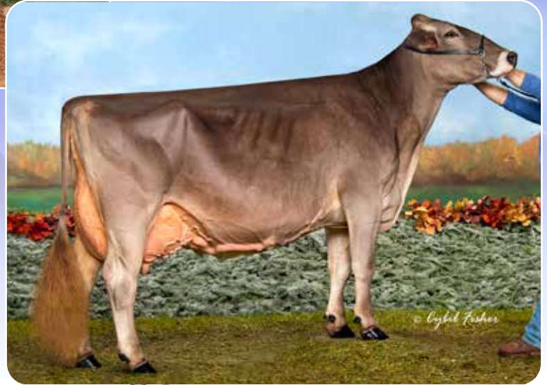
JO-DEE NEMO RISKY 3E94/95MS ALL-AMERICAN 3RD DAM OF LOT 72