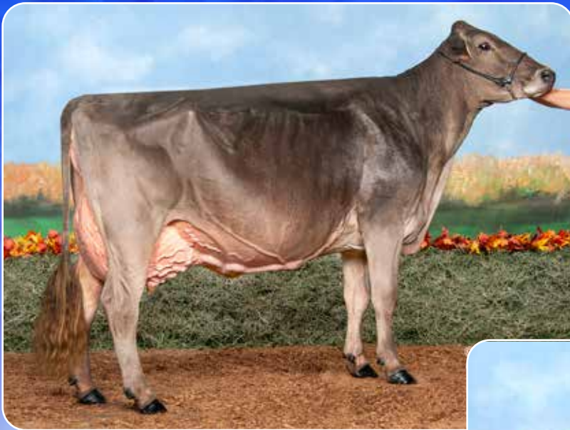
JO-DEE KINGPIN RAMROD 2E93 ALL-AMERICAN NOMINATED DAM OF LOT 72