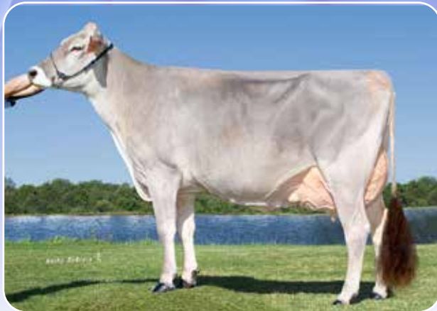
JUST SO D FORTUNE EX91/91MS ALL-AMERICAN DAM OF LOT 25