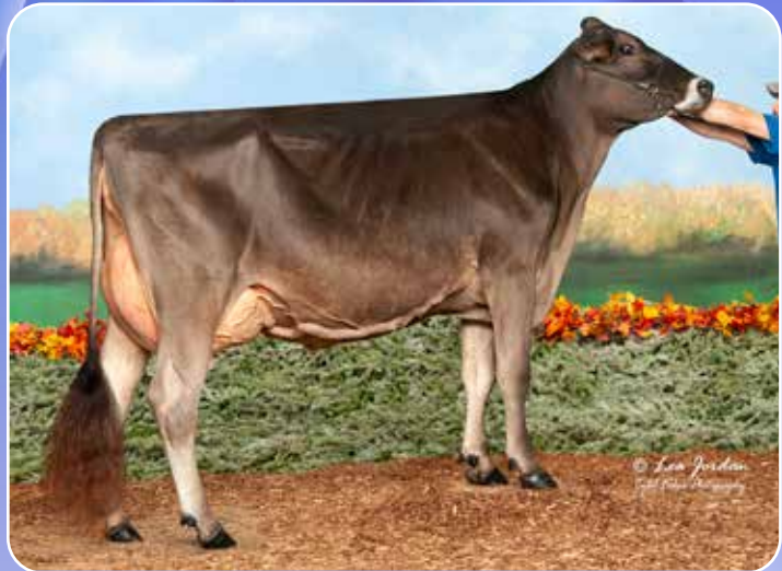
KRUSES MOONLIGHT JULIET ET EX91 HM ALL-AMERICAN MATERNAL SISTER TO LOTS 42 & 43