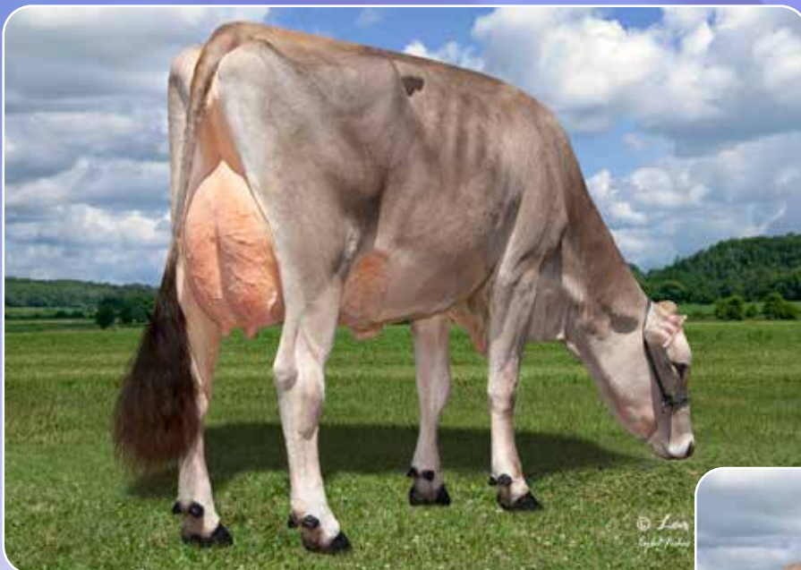
HILLTOP ACRES DB WHISPER ETV E91/91MS DAM OF #1 PTAT BULL & #2 PTAT HEIFER IN THE BREED DAM OF LOTS 33 & 34