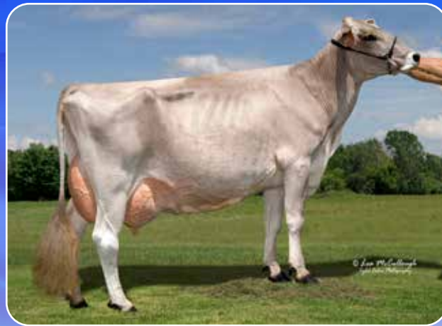
KRUSES LAZER CRISSY ET 2E92 3RD DAM OF LOT 46