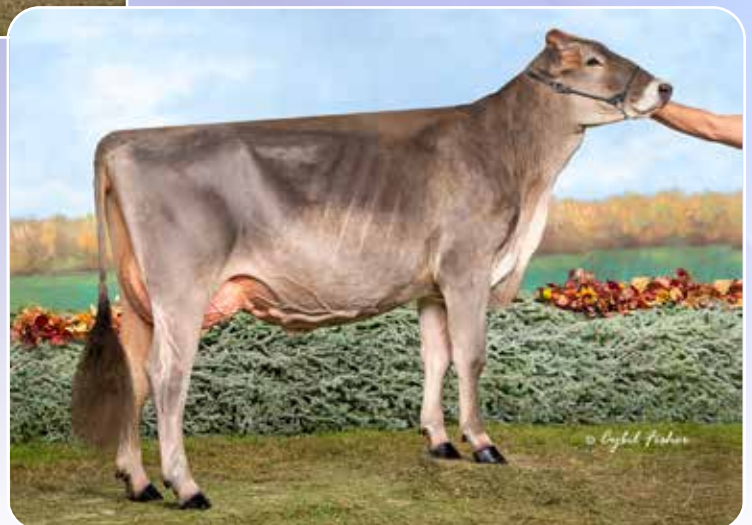
JENLAR DIEGGO WATERLOO ETV VG87 ALL-AMERICAN MILKING YEARLING 2024 #1 PTAT COW OF THE BREED! FULL SISTER TO LOT 19 MATERNAL SISTER TO DAM OF LOT 20