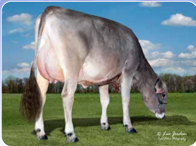
HILLTOP ACRES D TWIRL ETV V85/85MS DAM OF LOT 65