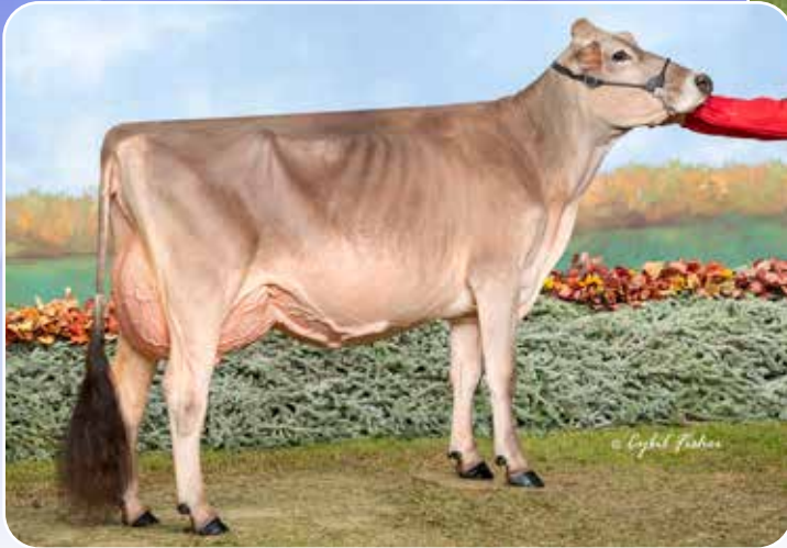
A JOY CP SNOW WHITE E91/92MS 3X ALL-AMERICAN NOMINEE IN MILKING FORM GRAND CHAMPION 2024 NY STATE FAIR MATERNAL SISTER TO LOT 49