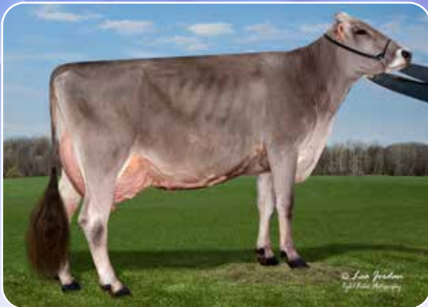
KRUSES LJ DAIRYSTAR SARA DAM OF LOT 47