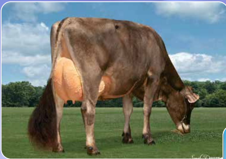
HILLTOP ACRES DB TABBY ET 2E91 GRANDDAM OF LOT 58 & 59

BULL MOTHER OF: HILLTOP ACRES TRICKSTER ET at Select Sires