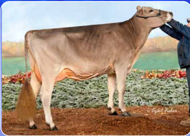
SUN-MADE ELITE NEITH ET E90/89MS ALL-AMERICAN NOMINATED DAM OF LOT 56