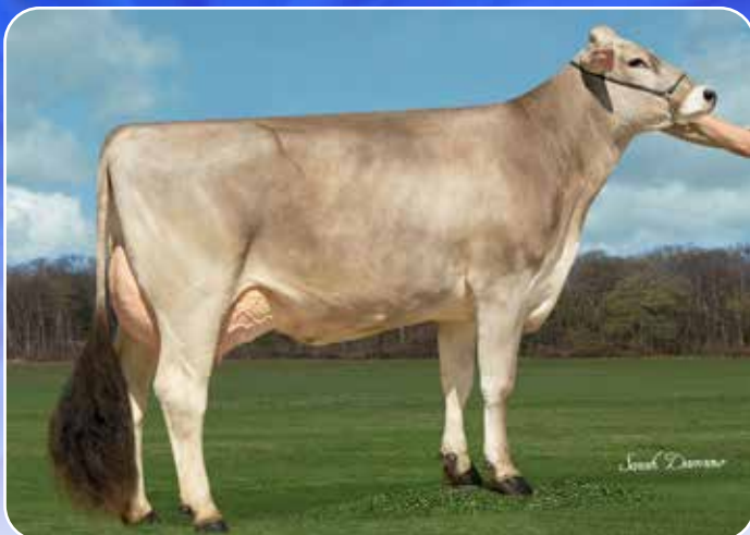
RED BRAE PACTOLE NICKI ETV V87 DAM OF LOT 67 & 68