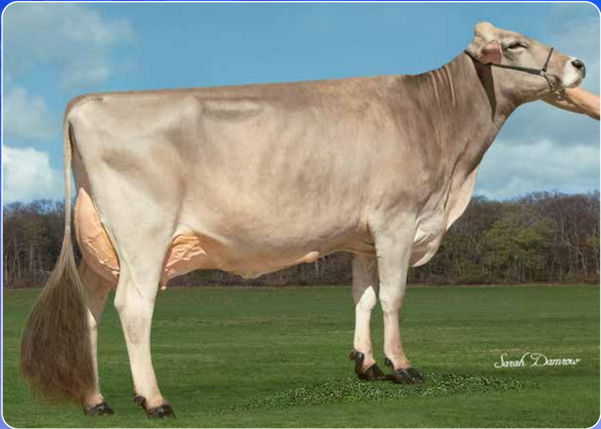
HILLTOP ACRES K TAMMIE ET E92/94MS DONOR DAM OF LOT 58 & DAM OF 59