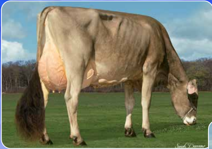
HILLTOP ACRES PAC TAEALYN ETV V86/86MS MATERNAL SISTER TO LOT 60 & DAM OF LOT 61