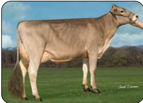
HILLTOP ACRES D TANIKA SELLS AS LOT 63

REG: 840003264521193 DOB: 1/28/2023 TATTOO: 3018 Genetic Conditions: PT DT MT WT BH2T BH14T Casein: A1A2 BB 01/11 +84 +84 V85 +80 +84 +84 (01/25) PPR: +36 64%R PTAT: +0.6 UDC +0.5175%R PTA: +553m +10f +16p +5NM$ 48%$ (GEN) DEV: +2675m +71f +72p (04/25) 01/10 129d 3X 10430 4.2 438 3.2 332 RIP Last test 119# 3.9%f 3.2%p