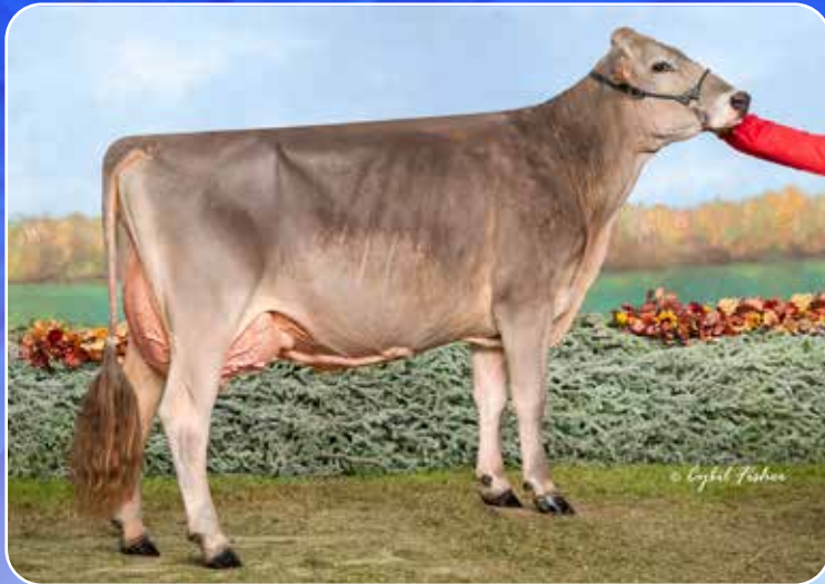
SHILOH F MARTINI TALO VG88/91MS ALL-AMERICAN NOMINATED DAM OF LOT 48