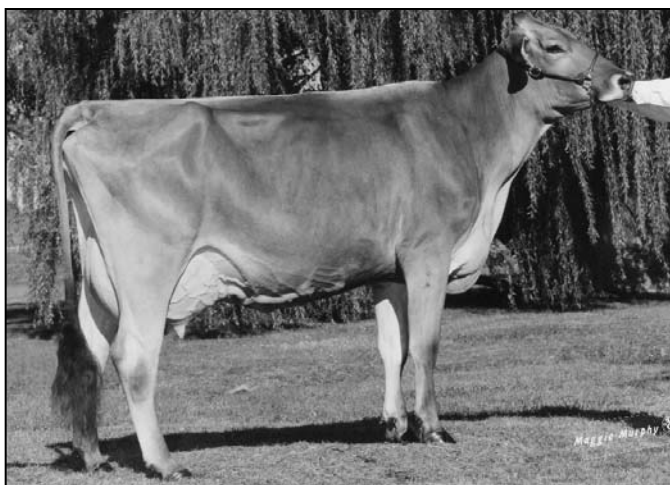
Lah-Dale PS Phoebe "Ex90/91MS" Dam of Lot B32