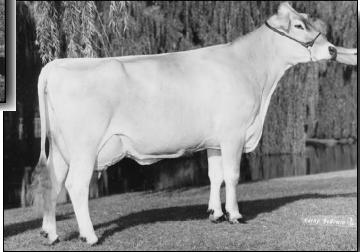
Ingleside Babaray Piper "E92" All American 3rd Dam for Lot B27