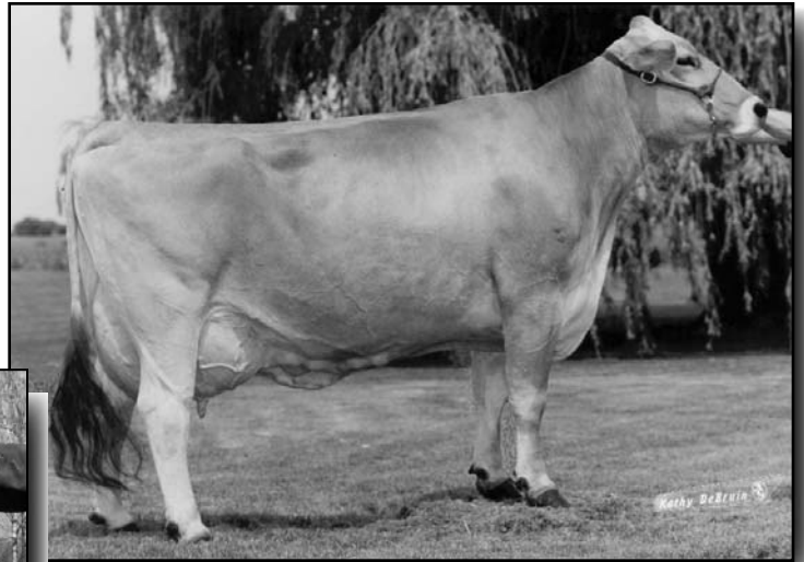
Little Cobb Even Kindy "2E93" Grandam of Lot B26