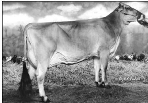
Spungold Jet Carol ET "2E93"