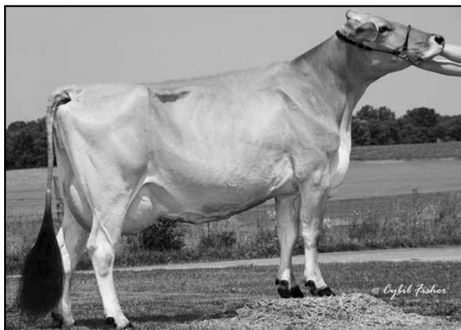
TOP ACRES JETWAY WISH ET "2E91/92MS" 2 All American Daughters