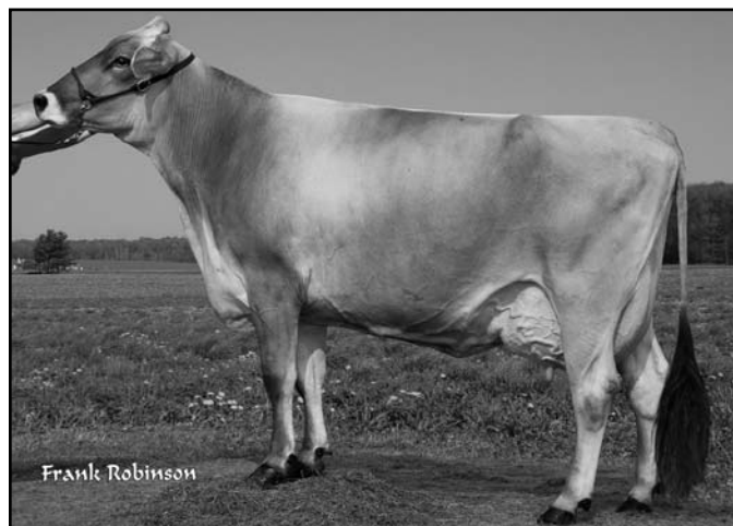
ROUND HILL PRE WISHFUL ET "2E91" All American, 2003