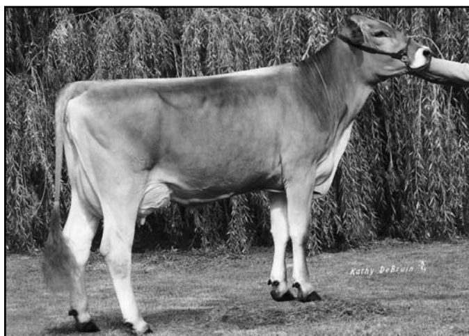
Cliff-Brook Zeus Huggy New Score - "E90/92MS"