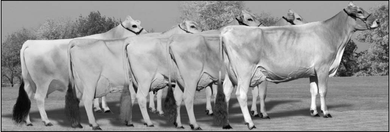
5 "Excellent" Dams for Lot 37