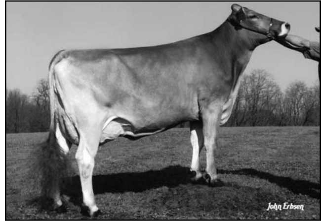
ALFA CREEK JAMAAR HOLLY "E91" 3-4 365d 32,392m 4.2% 1404f 3.3% 1055p