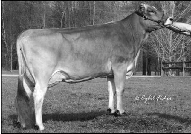
HILLTOP ACRES ABSOL HALO ET "VG88/90MS" 5-11 365d 3x 36,680m 4.9 1784f 3.0 1109p