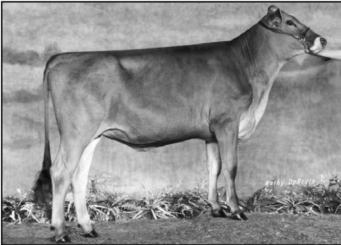
NORTH LANES BLUE DOROTHY ET Res. Ohio Jr. Bell Ringer, Spring Yearling, 2009