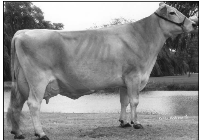
LA RAINBOW FANCY GIRL ET "2E94" 2x Reserve All American