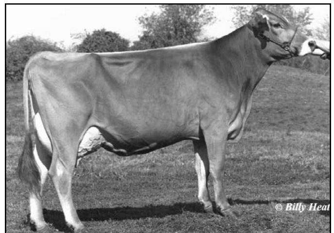
LAUTER BACH CHALLENGE DI "2E91" Reserve All American 3 Year Old, 1995