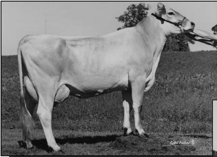
Topaz PC Candys Chance "2E91"