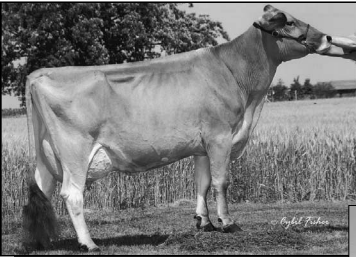
Bo Joy Jetway Jade "2E92/94MS"

4-8 365d 2x 32,800m 4.0% 1298f 3.4% 1107p