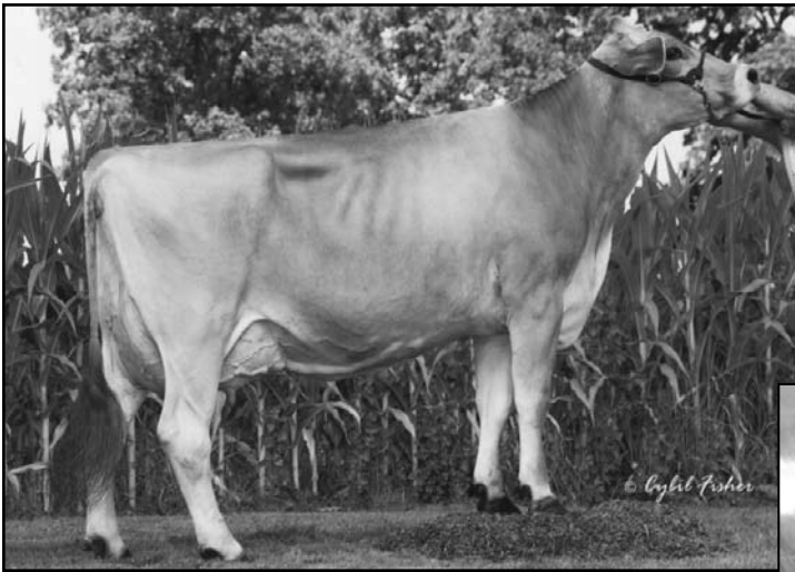
Kulp Gen J Pilot Starry ET "VG89/91MS"