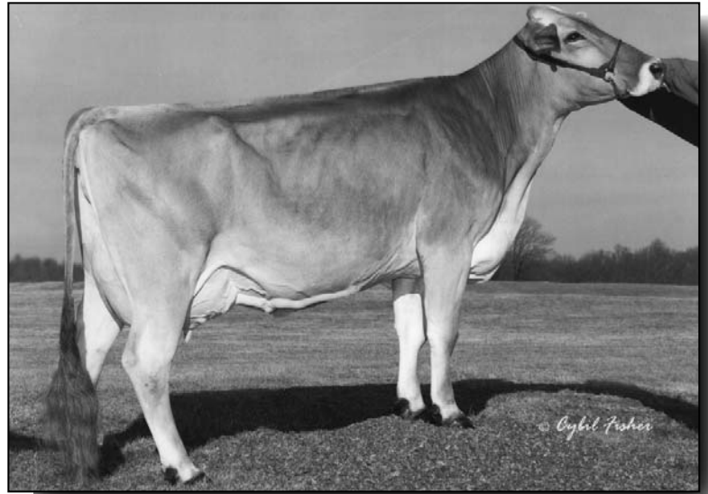
Sandy Dale Jade Freedom "2E91"

2x All American 2nd and 4th Dams for Lots 50 thru 54