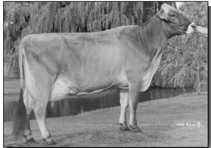
Campsswiss Supreme Faith "4E94"