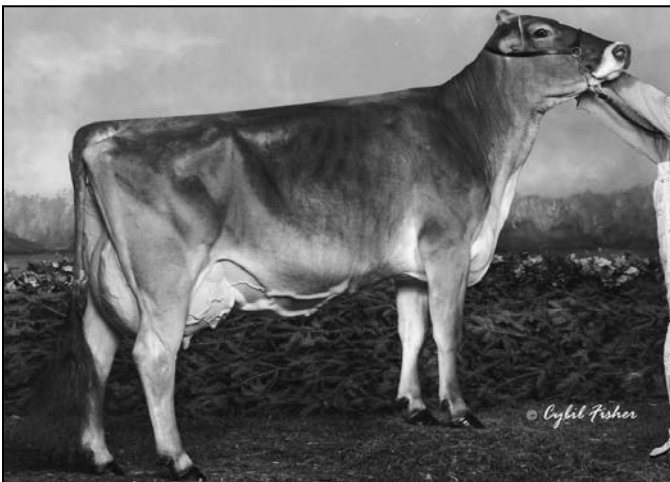
Round Hill Legacy Flyhi "E92"

Grand Champion, New York State Fair, 2009 Sold for $35,000 Starmark, 2009