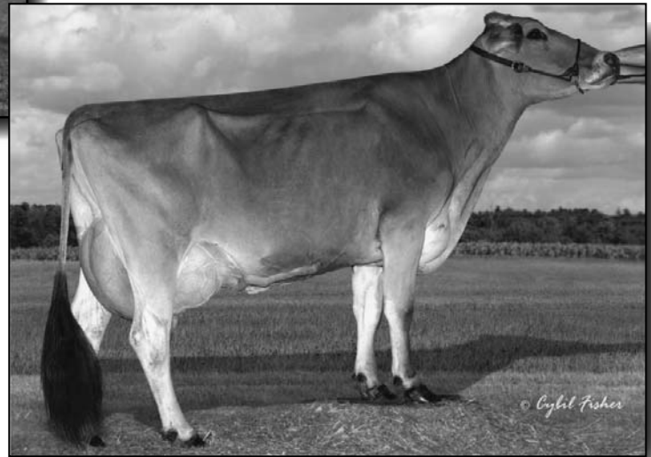
HF Pronto Katriel "2E93"