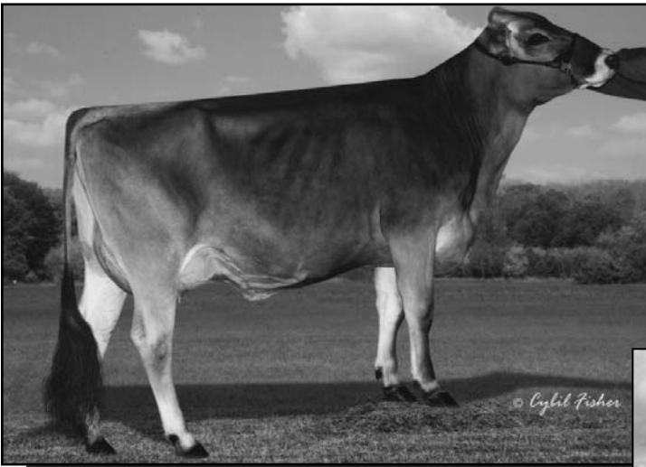
Lost Elm Ensign Future ET Potential 6th Generation "Ex"