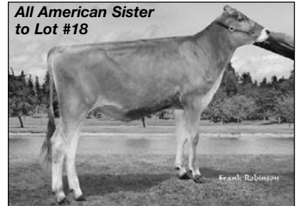
All American Sister to Lot #18

SUN-MADE GARBRO G PETAL ET 885643 4/06 "E92" E92 E92 E90 E91 E92 2/04 365d 2x 27070 5.2 1412 3.9 1050 4/00 365d 2x 29818 5.2 1540 3.6 1068