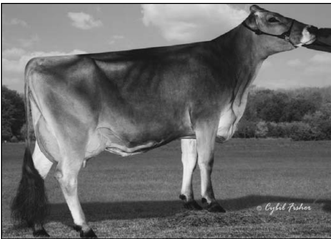
Lost Elm Beamer Pillow "VG88/92MS"