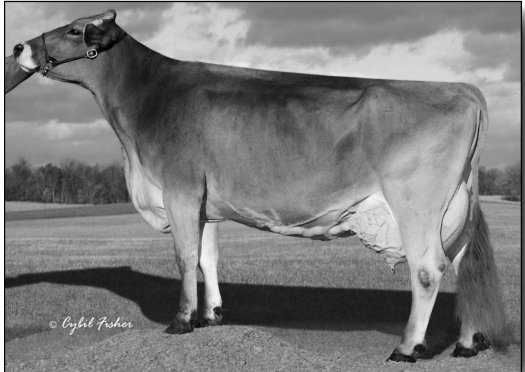
Lost Elm Prelude Pixy ET "2E92" World Champion for Milk and Fat